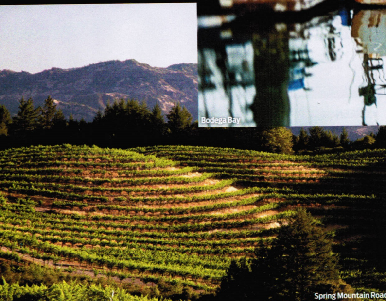
Spring Mountain Road

Another Sonoma County favorite is Pepperwood Preserve , where she's a devoted member. "I first went there on a school field trip, and absolutely fell in love with the project. They brilliantly mix science and art and offer the most interesting guided hikes. It got hit by the 2017 fires, so it is definitely something that needs our support."